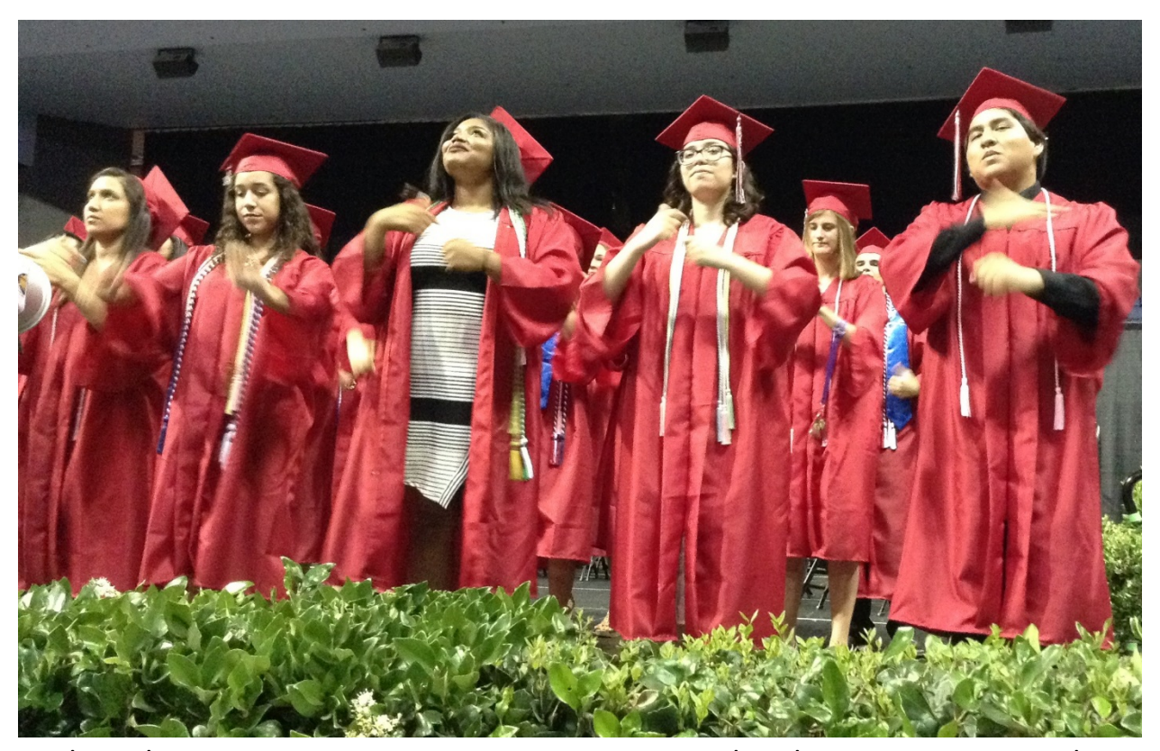
Ayala High seniors practice American Sign Language hand movements to go along with the song "I Lived," which is also the Class of 2016's motto.