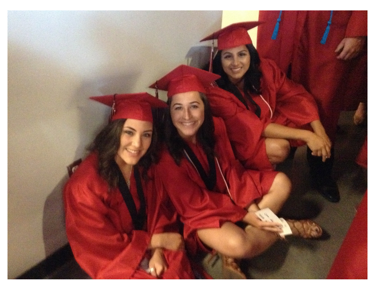
Three Ayala High seniors take it easy moments before the graduation ceremony begins.