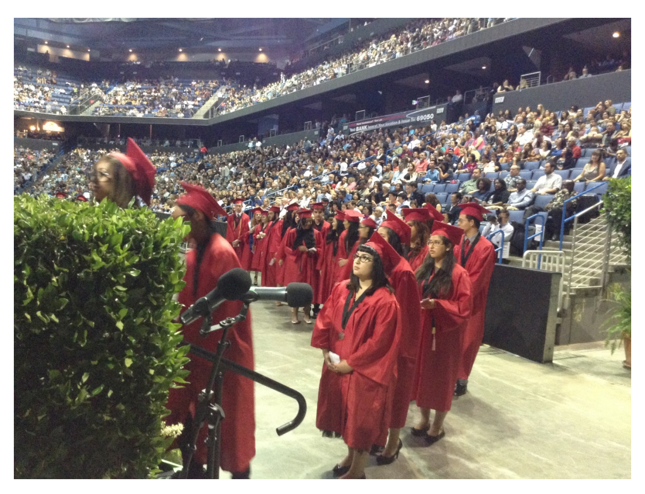
The seniors ascend the stage to receive their diplomas.