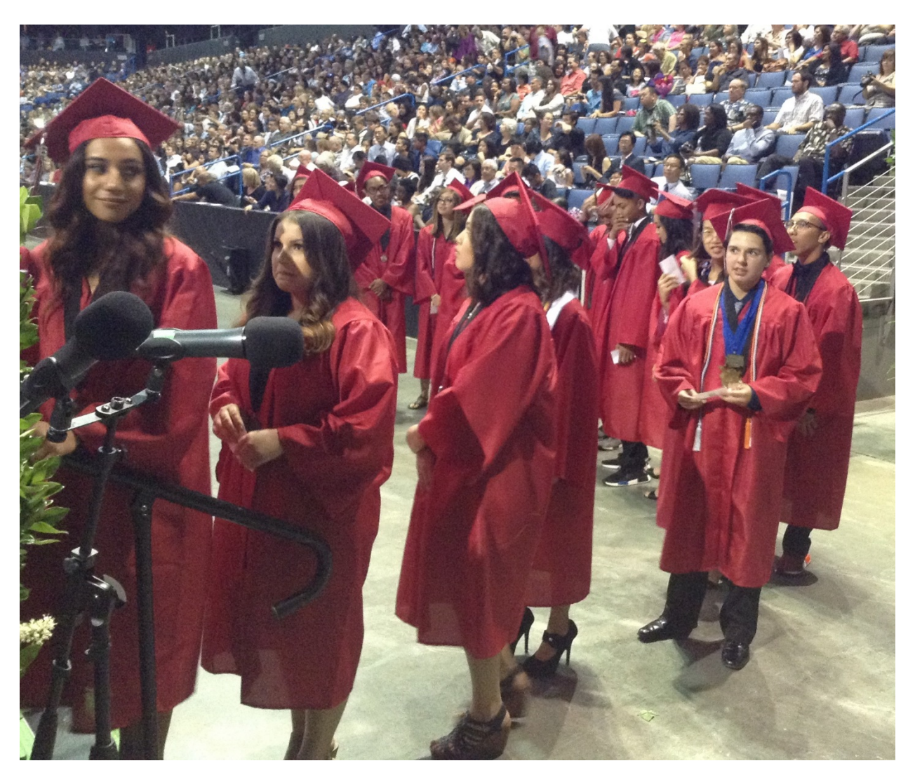
Ayala High seniors prepare to take the stage. Packed into the seats around them are family and friends.