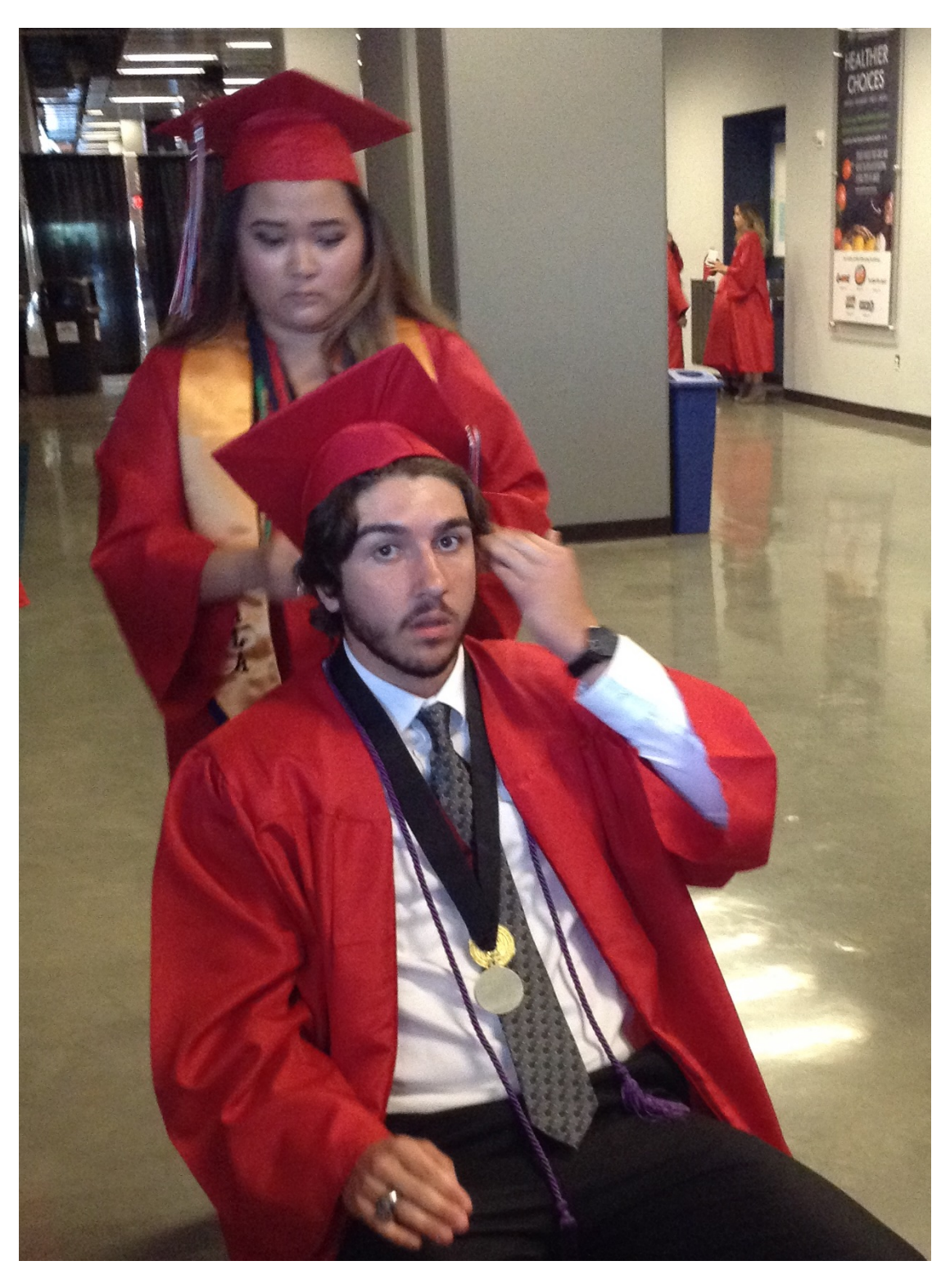
A senior gets some help with his graduation cap.