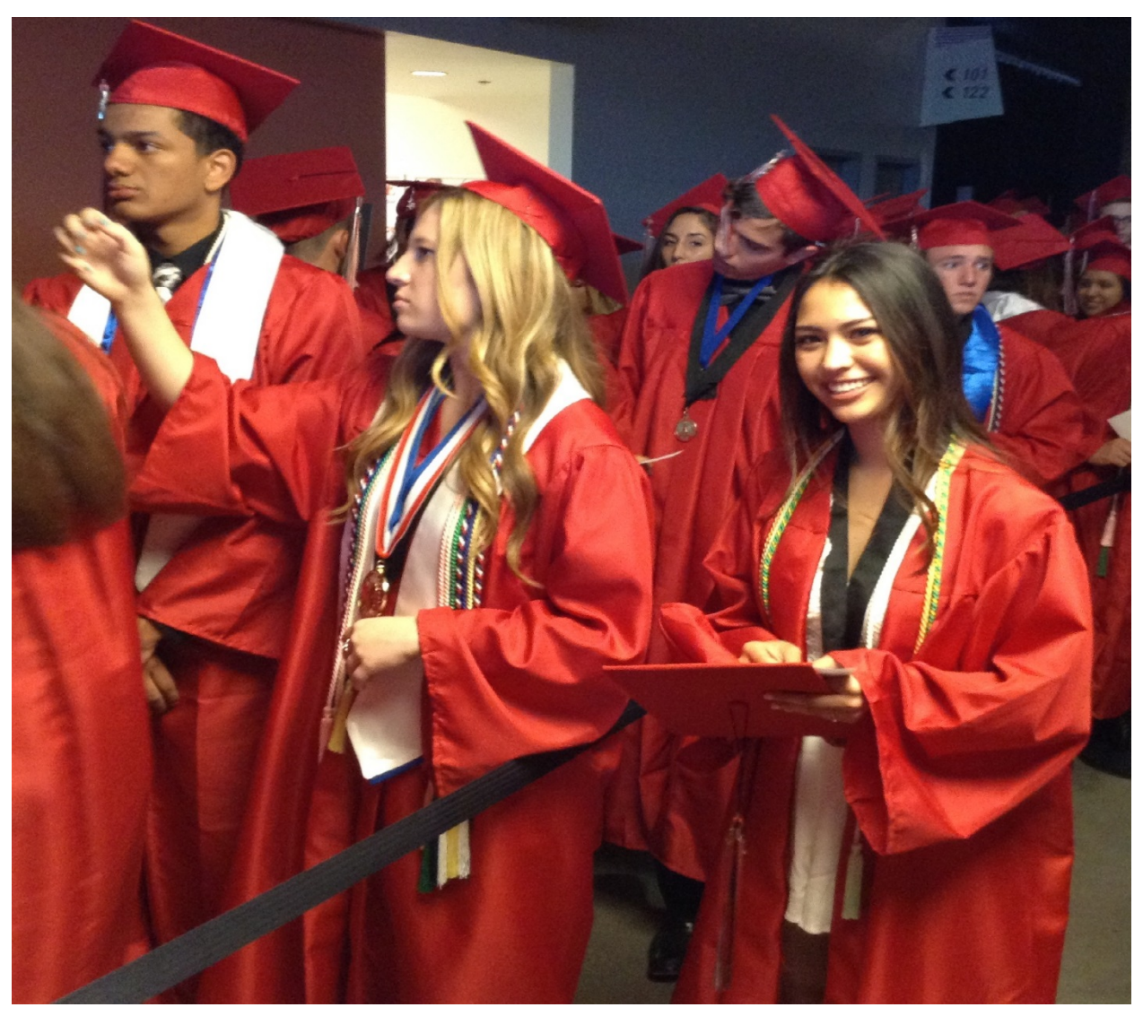
Ayala High's Class of 2016 show a variety of emotions as they await the start of their commencement ceremony.