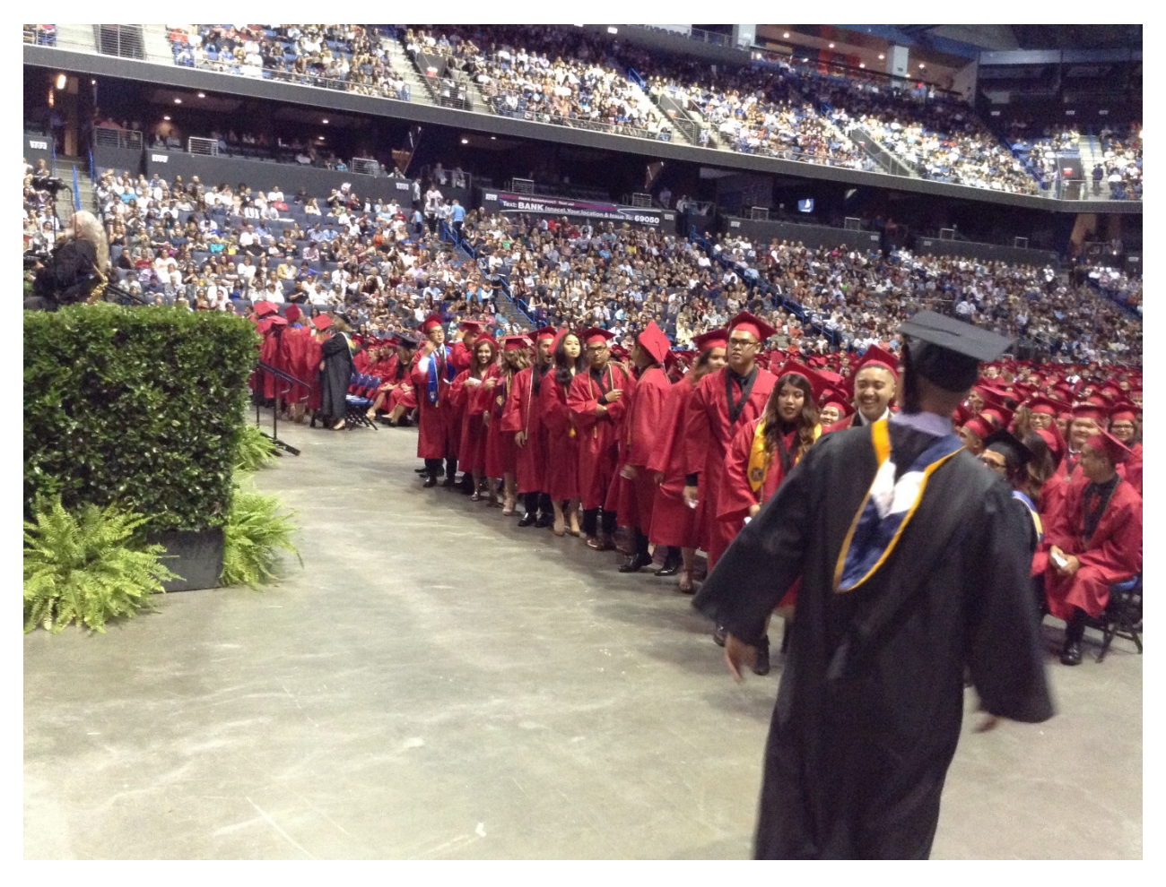
An Ayala High faculty member gives the first row of seniors the cue to procced to the stage for their diplomas.